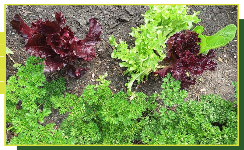
Red and green lettuces planted with parsley. (Esther McGinnis, NDSU)

The scalloped leaf margins somewhat resemble dandelions. Salad types usually feature a broader, mild-flavored leaf. Wild types with highly serrated leaves, such as the variety Dragon's Tongue, are spicier. Arugula is a quick crop, with 35 days to maturity, although younger leaves also may be harvested.