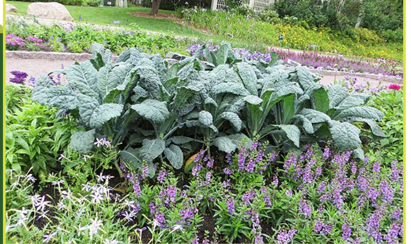
Dinosaur kale is so beautiful it can be planted in your ornamental beds. (Esther McGinnis, NDSU)

Kale comes in several types, including ornamental varieties. Commonly available edible varieties for North Dakota include Winterbor, Redbor, Dwarf Blue Curled Vates, Black Magic and Lacinato. The last two are varieties of dinosaur kale, otherwise known as Tuscan kale. The striking blue-green leaves of dinosaur kale have become extremely popular across the country.